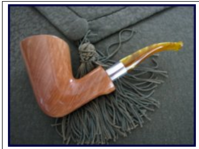
2005 Katrina Auction Piece (See addendum)